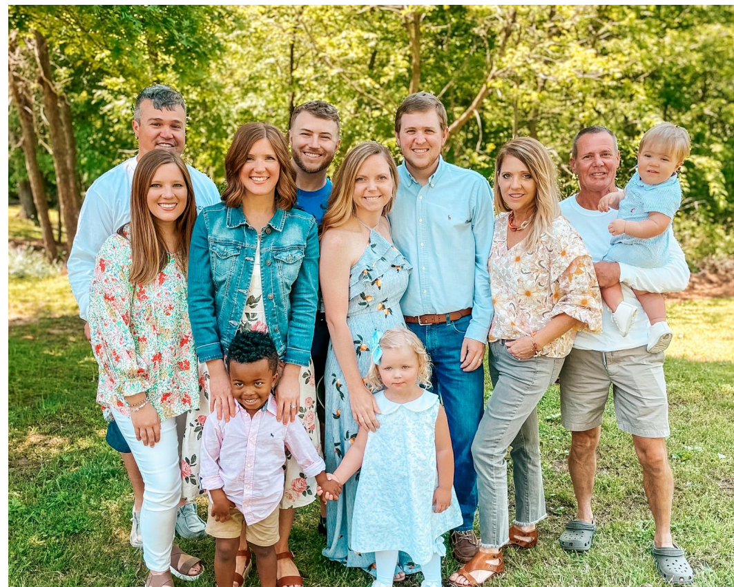
We always enjoy Sunday family dinners, especially when we are able to talk the boys into a photo!