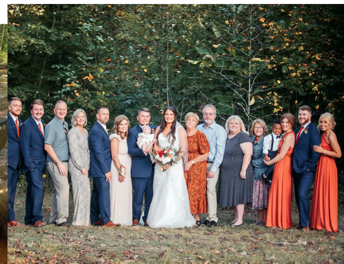
The whole family at cousin Trey's wedding. It was a beautiful day celebrating with each other!